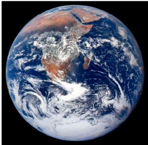
The Blue Marble from Apollo 17, NASA, 1972

Currently, the emergence of sustainable development was mainly an intellectual answer to reconcile the conflicting goals of economic growth with environmental protection.