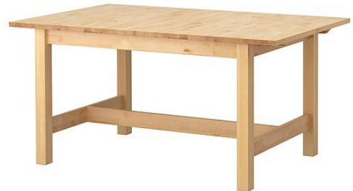
table legs: 0.80 metres (length)

Write sentences on your own like in the exercise below: